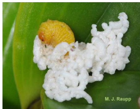
Eggs laid by dendrobium beetle.

If you do ... you can control by spraying an insecticide when you see them. The easier and more challenging way is to sneak up on them (there is always two of them), place your hand slowly below the leaves being eaten by the buggers and then, with your other hand try to grab them - if you miss, they will hopefully drop into your other hand as their defence is to drop to the ground when disturbed, now with a smile on your face, crush them.