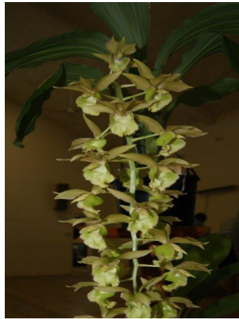
L & B Frame