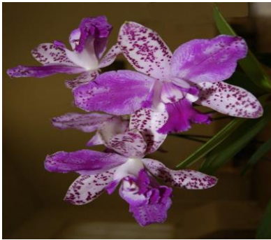
L & B Frame