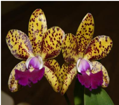
K & K Rose